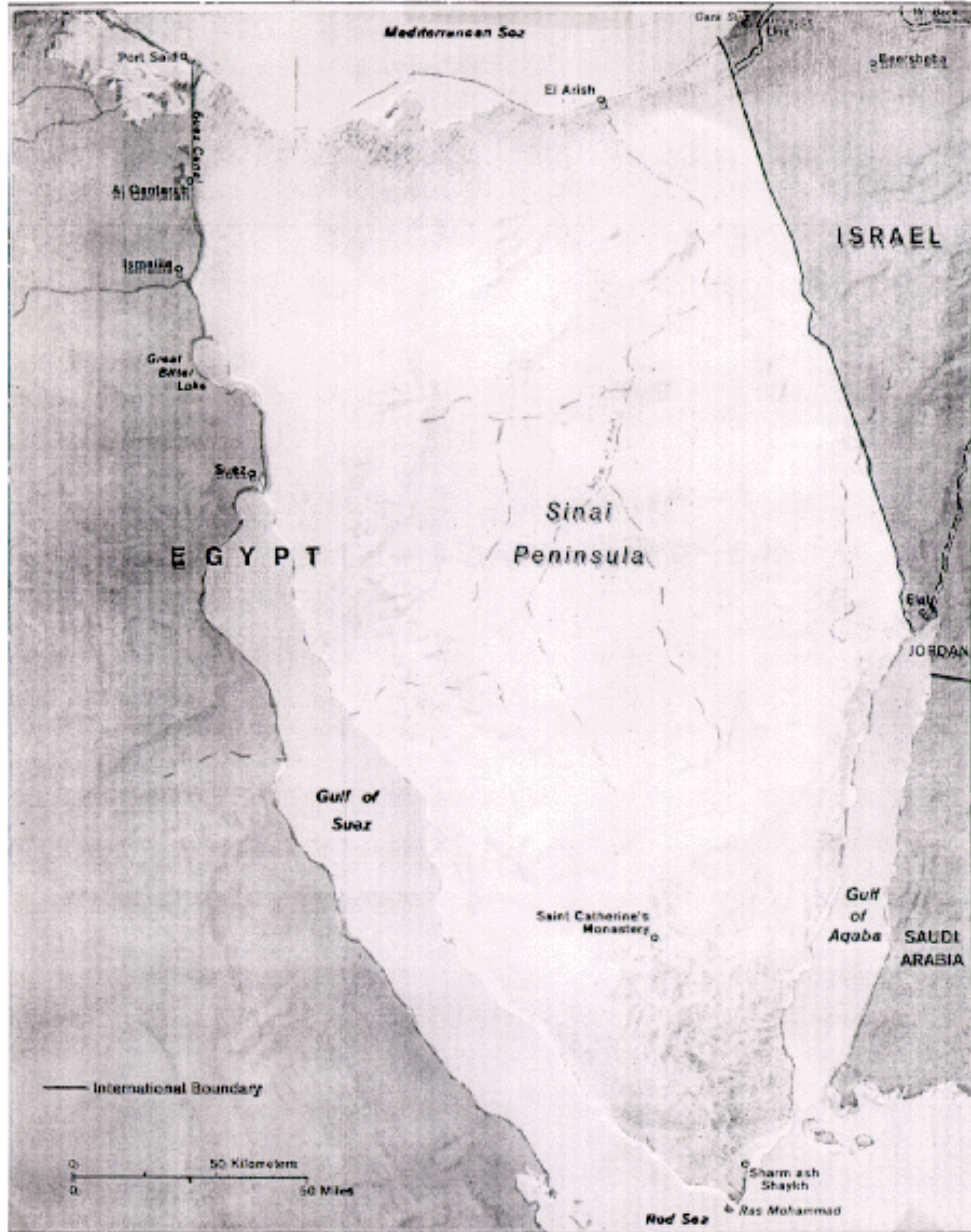
ANNEX II – International Boundary