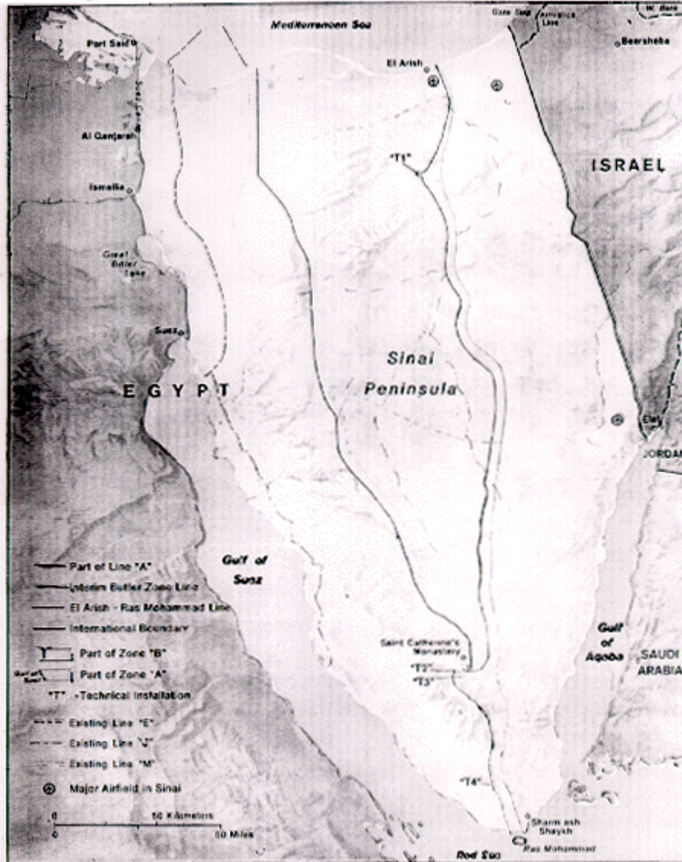
MAP 2 – Lines and Zones Effective when Israeli Forces are on the El Arish - Ras Mohammad Line